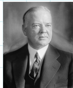
Charles Curtis—Vice President of the United States 1929-1933